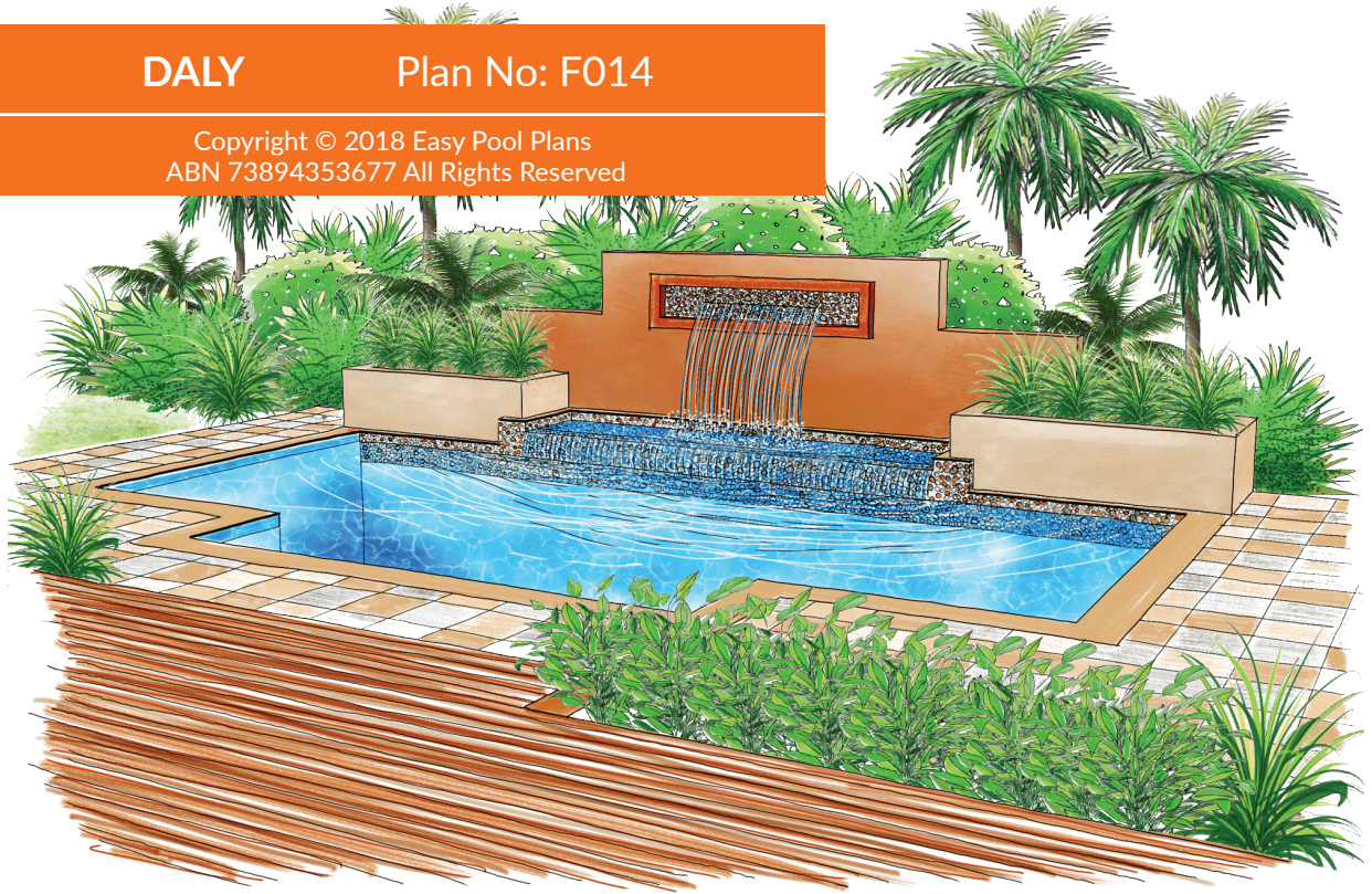
© 2018 Easy Pool Plans Suggested Landscape Concept

DALY Plan No: F014 Copyright © 2018 Easy Pool Plans ABN 73894353677 All Rights Reserved