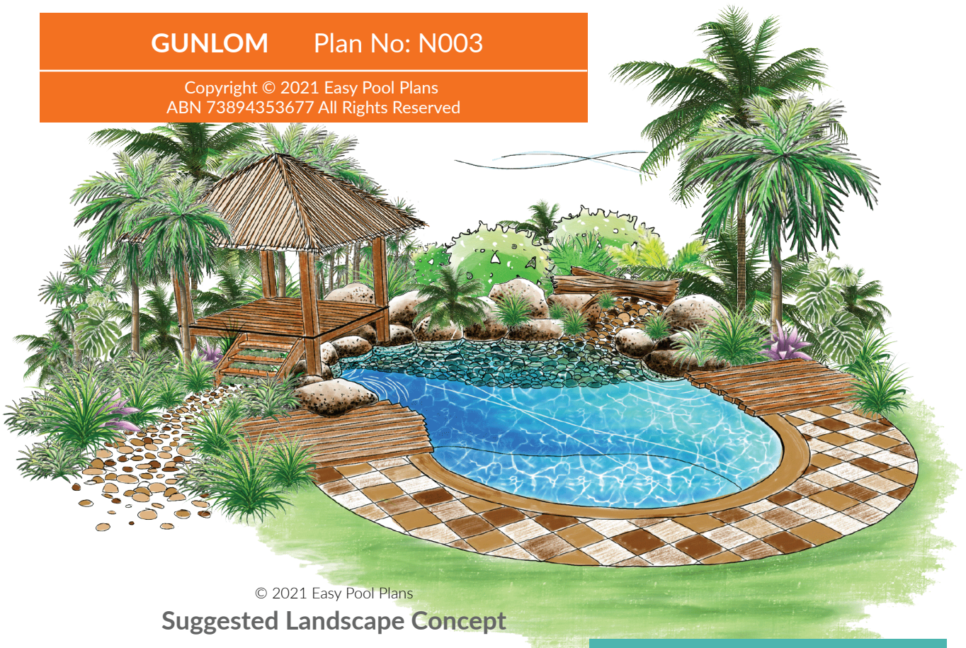
© 2021 Easy Pool Plans Suggested Landscape Concept

GUNLOM Plan No: N003 Copyright © 2021 Easy Pool Plans ABN 73894353677 All Rights Reserved